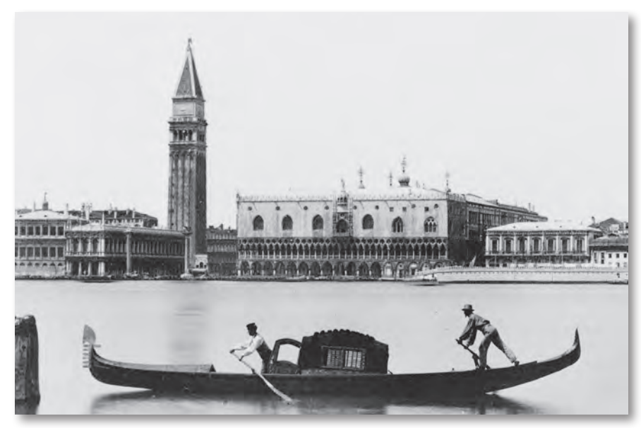
The city of Venice and the surrounding province of Venetia were under Austrian control until 1866, when it joined the newly united kingdom of Italy.

The conversion of Germany from several hundred states into a single country took several centuries. Its final stages took place late enough in history to be reflected in the post-1850 U.S. Census. Some German states were important European powers, but many were only the size of a US county, and some were only a few square miles. Even the duchy of Saxe-Coburg-Gotha, where Queen Victoria's husband Prince Albert was born, covered only 768 square miles in 1854.