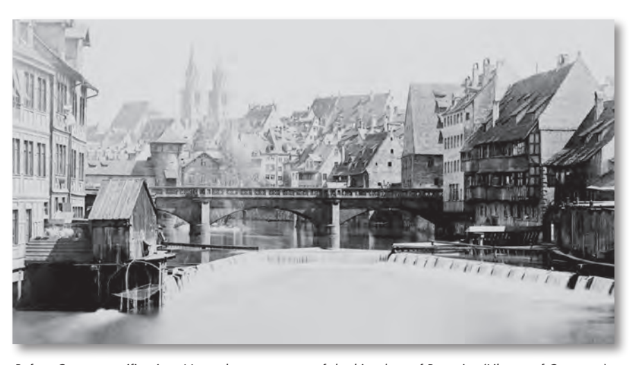
Before German unification, Nuremberg was part of the kingdom of Bavaria.

The states of Liechtenstein and Luxembourg, although they contained many German speakers, ended up as independent nations. Liechtenstein, placed between Austria and Switzerland, became fully independent during